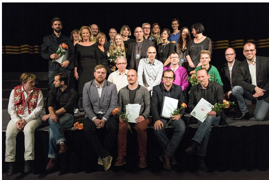
exground filmfest award ceremony

With a festive awards ceremony and subsequent finale reception for a sold-out house at Caligari FilmBühne in Wiesbaden, exground filmfest celebrated the successful conclusion of its 29th edition this past Sunday evening after ten days featuring the best of independent cinema. Following the screening of the program for the German Short Film Competition, cash and material prizes worth more than 20,000 euros were awarded in five competition sections, including the inaugural presentation of DAS BRETT , the winner of which was selected by a jury composed of inmates from Wiesbaden's correctional facility. The presence of numerous international guests and over 14,000 festival attendees testified once again to the great popularity of the festival, which reaches far beyond the city limits of Hessen's state capital.