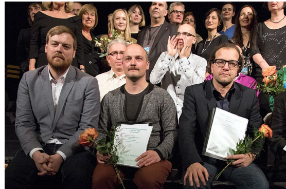
exground filmfest award winners